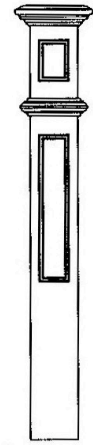
5 \frac{1}{2} '' Westhaven Post