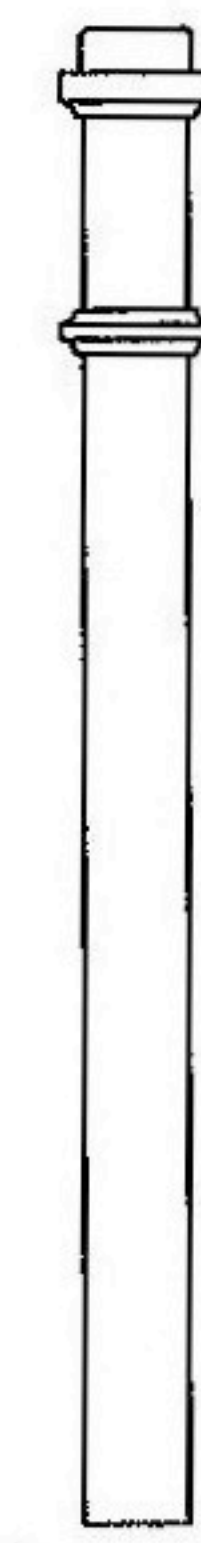
3 \frac{1}{2} '' Windsor Post