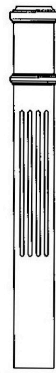
5 \frac{1}{2} '' Oxford Post