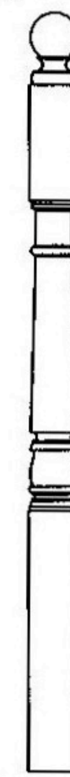
3 \frac{1}{2} '' Heritage Post