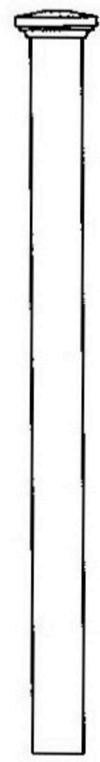
3 \frac{1}{2} '' Contempra Post