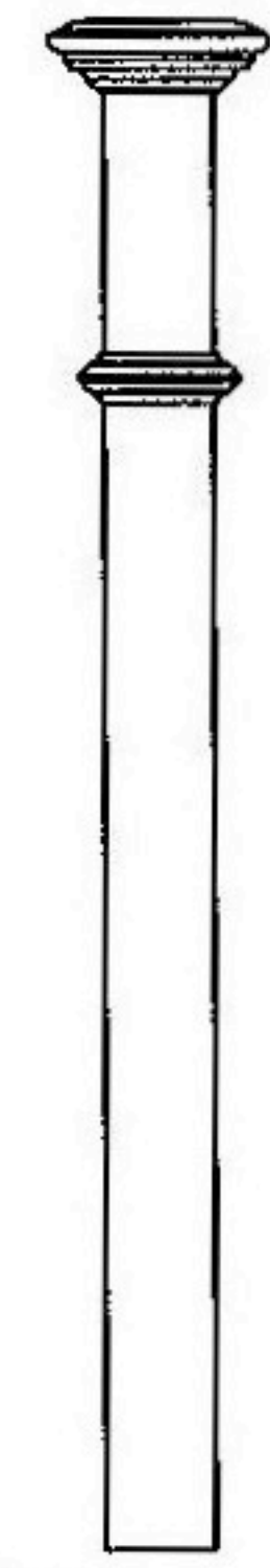
3 \frac{1}{2} '' Westhaven Post