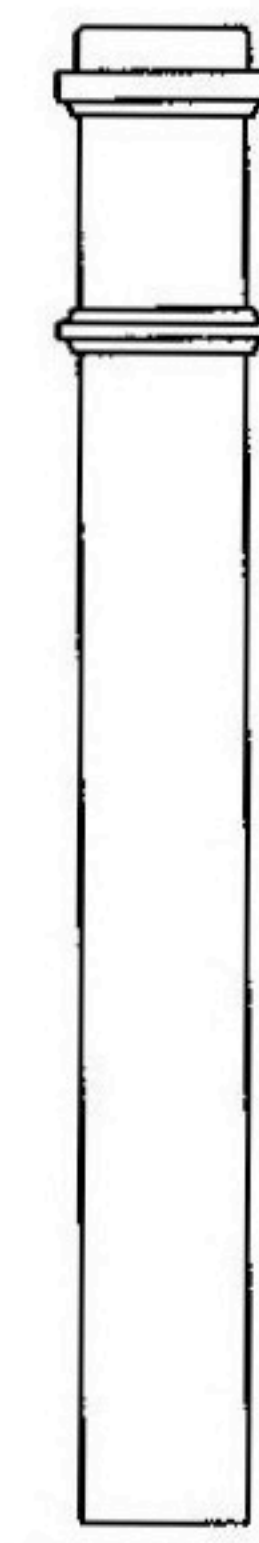
5 \frac{1}{2} '' Windsor Post