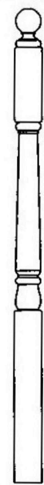
3'' Traditional Post