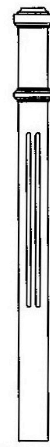
3 \frac{1}{2} '' Oxford Post